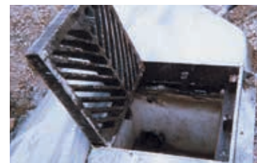
Catch Basin Adjusting Frame