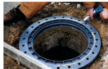
Manhole Adjusting Ring