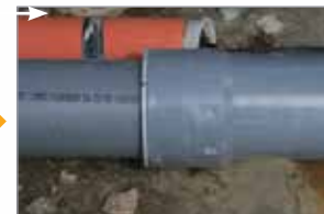
RESULT: FULLY RESTORED DUCT