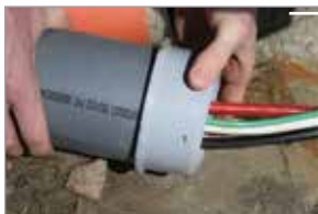
CEMENT ADAPTER ONTO DUCT