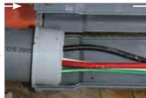
CEMENT EPR KIT INTO PLACE