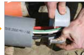
OPEN ADAPTER AROUND CABLES