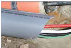
BROKEN SECTION OF DUCT