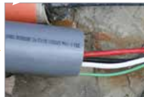
CUT DUCT AS PER EPR KIT INSTRUCTIONS