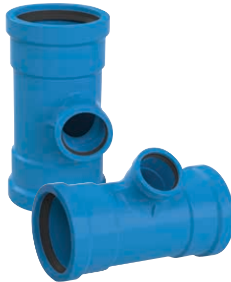
Blue Brute® Hammer Tee